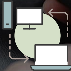
PARTICIPATION IN PROJECTS