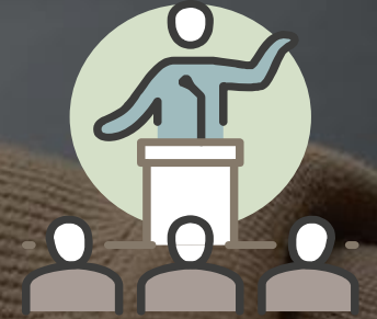
TECHNICAL TRAININGS AND WORKSHOPS