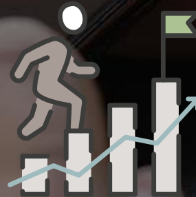
CONTINUOUS CONTRIBUTION TO TEAM WORK