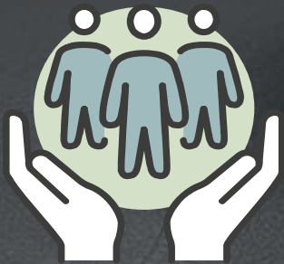
MENTORING AND FEEDBACK SOCIAL ACTIVITIES