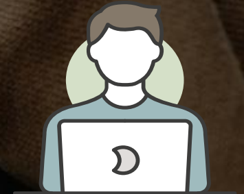
LONG – TERM EMPLOYMENT AND FURTHER GROWTH